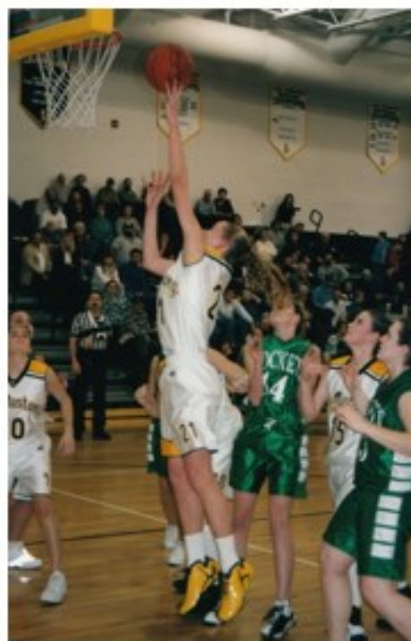
Whitney in action vs. Fayetteville.