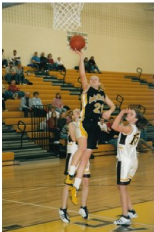
Whitney in action vs. Georgetown