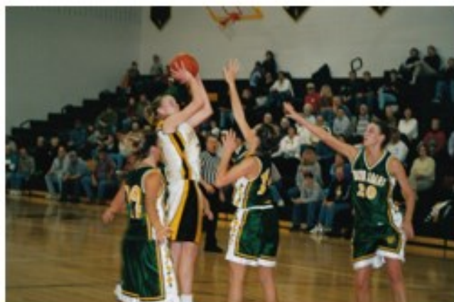
Whitney in action vs. North Adams.