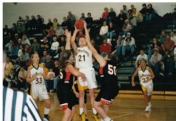
Whitney in action vs. Whiteoak.