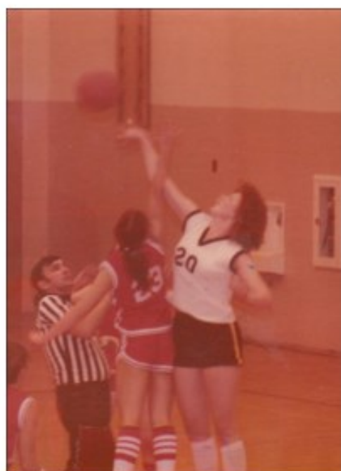
----- Linda jumping center vs. Peebles.